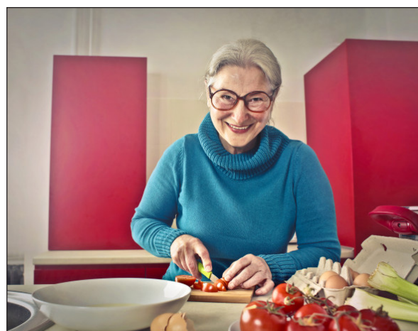
Healthy eating promotes healthy aging.

While the term food desert does not have one particular definition, it refers to the physical distance from healthy foods and food outlets. Despite the differences between urban versus rural areas, food deserts compromise an older adult’s ability to access healthy foods, which can lead to adverse health outcomes, exacerbated disease, and increased utilization and cost of healthcare. 12,16