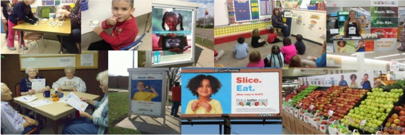
These are photos of the Iowa SNAP-Ed program